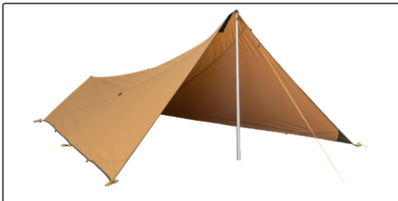
Canopy 7/9 put up as a shelter