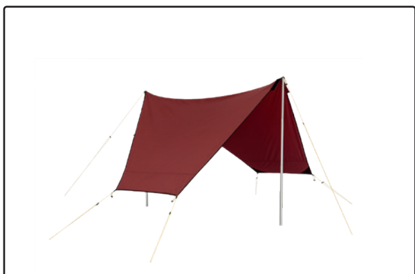
Canopy 5/7, lightweight model, put up as a freestanding canopy

There are two cords on each long side of Canopy 7/9 as well which can be used if more stability is required.