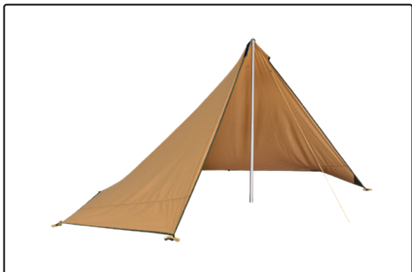
Canopy 5/7 put up as a shelter

First of all, put a tent peg in the band loop on the side opposite the side with the Velcro fastening. Push the end of a telescopic pole through the eyelet by the Velcro fastening and adjust it to a suitable height. Peg the cord down and tighten it. Place tent pegs along the long sides. Canopy 5/7 has band loops for two tent pegs on each side while Canopy 7/9 has band loops for three tent pegs on each side.