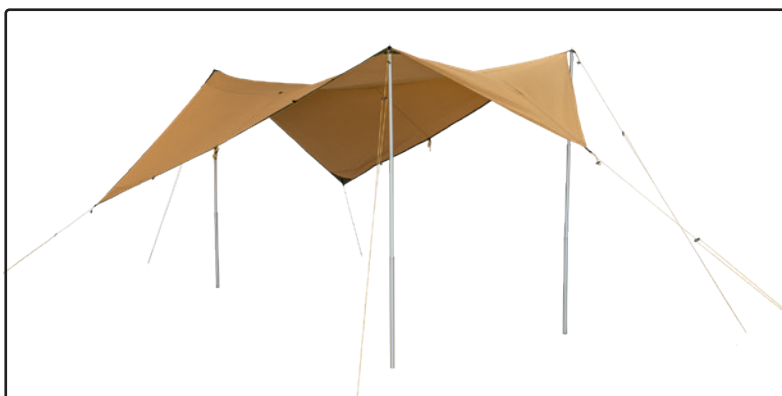
Canopy 7/9 put up as a freestanding canopy